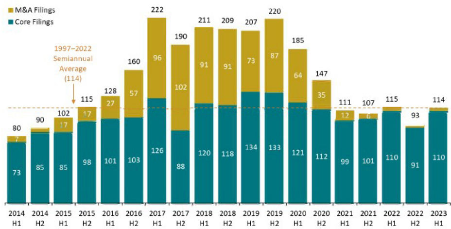
Semiannual Number of Class Action Filings (CAF Index®) January 2014 – June 2023

Note: This figure presents combined federal and state data. Filings in federal courts may have parallel lawsuits filed in state courts. When parallel lawsuits are filed in different years, only the earlier filing is reflected in the figure above. Filings against the same company brought in different states without a filing brought in federal court are counted as unique state filings. As a result, this figure's filing counts may not match those in Figures 4–6, 11, 12, 14–16, and 18, or Appendices 2, 4, and 5. See Additional Notes to Figures for Counts and Totals Methodology.