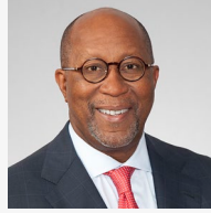
Ronald Kirk Dallas +1 214.698.3295 rkirk@gibsondunn.com