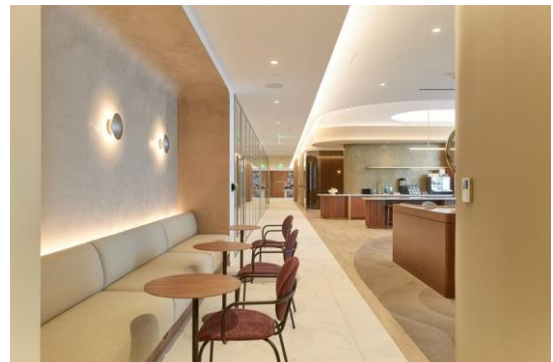
The coffee bar/snack bar area.

The 2000 Avenue of the Stars building is directly across the street from the historically designated Fairmont Century Plaza hotel and a block away from the upscale Westfield Century City shopping mall. When the Century City Metro station opens in 2026, it will be on the northeast corner of Constellation Boulevard and Avenue of the Stars, directly across the street from the 2000 Avenue of the Stars building.