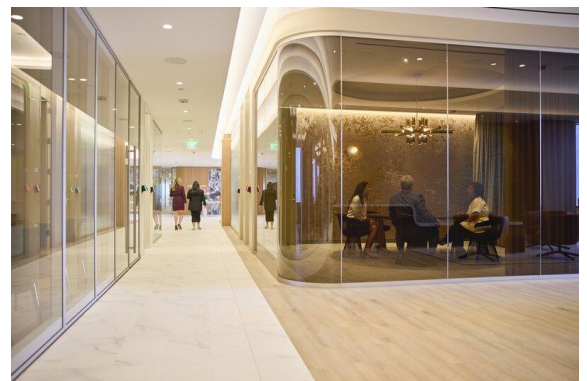
One of several conference rooms in Gibson Dunn's new Century City office.