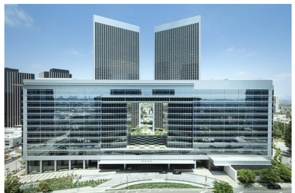
The 2000 Avenue of the Stars building with the Century Plaza Towers, the previous home of Gibson Dunn's Century City office, in the background.

Gibson Dunn did not indicate any attorneys have joined the Century City office in the past year.