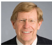
Theodore B. Olson 202.955.8500 tolson@gibsondunn.com

Decided May 30, 2017 (581 U.S. ____). Federal Circuit/Reversed and remanded. Chief Justice Roberts for a 7-1 Court (Ginsburg, J., concurring in part and dissenting in part; Gorsuch, J., took no part in the case). The Court held that selling a product exhausts all of the patent holder’s patent rights in that product even if (i) the patent holder placed express post-sale restrictions on the product or (ii) the sale occurred outside of the United States. Under the “exhaustion doctrine,” the sale of a product extinguishes all of the patent holder’s patent rights in that product. The Federal Circuit, however, held that patent holders may avoid exhaustion by expressly prohibiting reuse or resale of their products, and that no exhaustion occurs when a product is sold abroad. The Court reversed on both counts, explaining that exhaustion limits the rights of the patent holder , not the product buyer , and therefore exhaustion applies even when the patent holder clearly prohibits resale. If the patent holder negotiates a contract restricting a purchaser’s right to use or resell the item, then contract law might provide a remedy for any breach, but a suit for patent infringement is unavailable. Further,