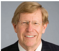
Theodore B. Olson