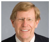
Theodore B. Olson