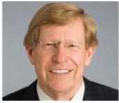
Theodore B. Olson 202.955.8500 tolson@gibsondunn.com