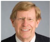
Theodore B. Olson